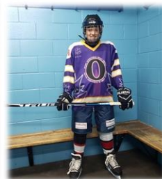
Clare-Digby Minor Hockey