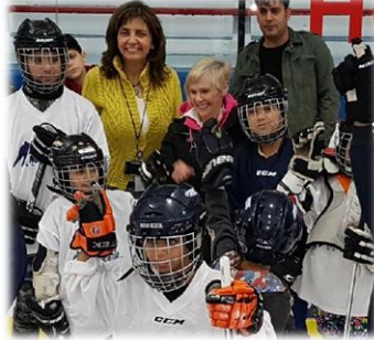
New Canadian Minor Hockey Development