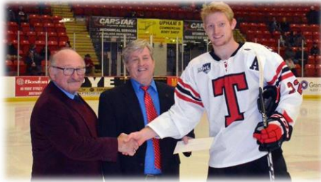
Maritime Junior MHL

The BBHAF has financially assisted and supported many players, teams and organizations, both male and female, at virtually every level of hockey. This support includes individual grants & assisting players with various special physical challenges; providing equipment for players in need; coaching equipment as well as tournament travel costs; we have donated several thousand pucks throughout five provinces and five states with our BBHAF 'A Puck Never Dies' program; continue to finance an annual MHL – BBHAF Bursary.