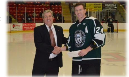
Maritime Junior MHL