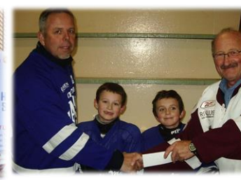
Chester Minor Hockey