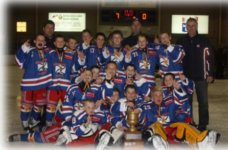
Nova Scotia Selects