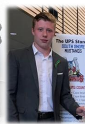
NS Major Midget