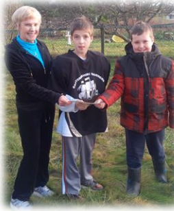
Eastern Shore Minor Hockey