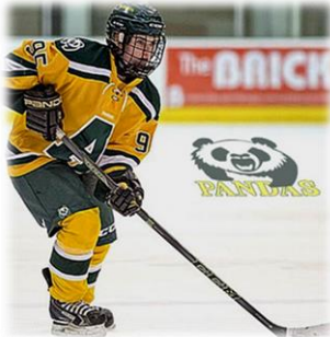
Univ of Alberta (Usport)